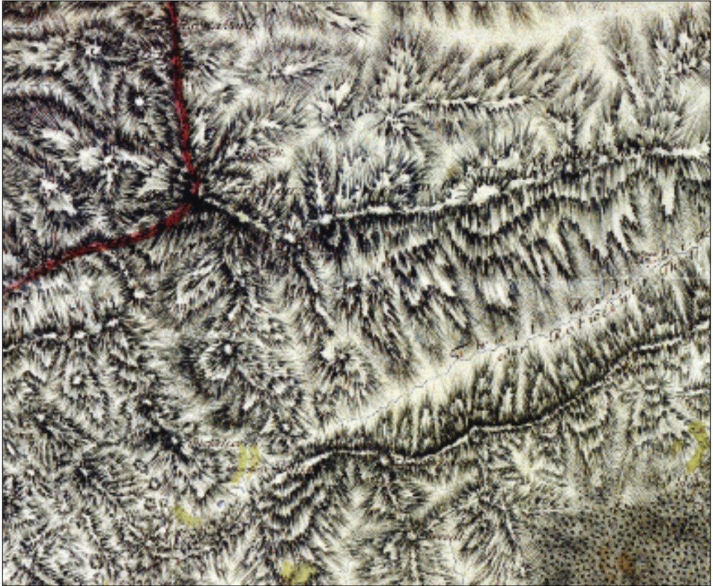
Figure 14: »Terglau« (Mount Triglav) and surroundings on the Joseph II Military Land Survey (survey Inner Austria (1784–1787), Section 134 (B1, C1); Rajšp and Serše 1998). The most notable inscription is »Kerma Gebirge« east of Mount Triglav on the ridge of Mount Rjavina (2,532 m). On the latter map of the Second Military Survey from the 19th century the geographical name »Kerma« is already in today's Krma Valley.