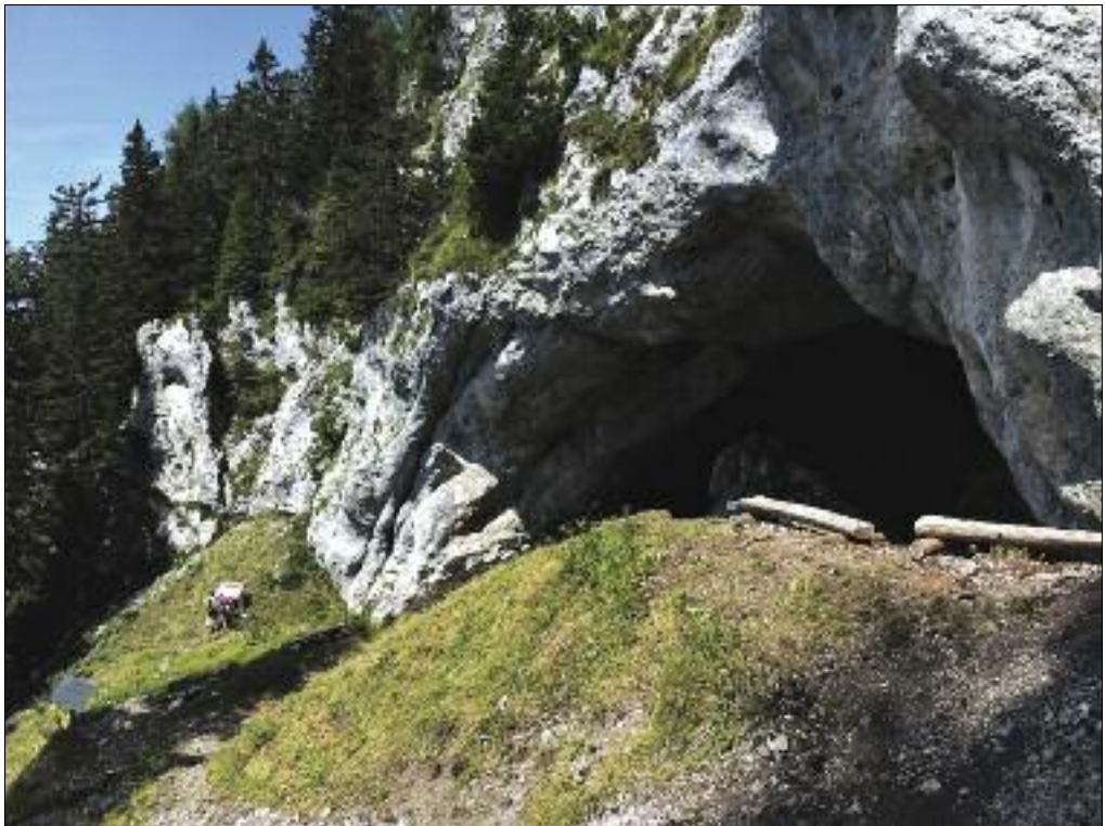
Figure 4: Potočka Zijalka is an important cave site from the early Upper Paleolithic.

In the Middle Ages, the Alpine passes were becoming more and more important for conducting trade. The routes over the passes of the Karavanke mountains were surely known in prehistoric times, and Roman finds prove that the Ljubelj Pass (1,370 m) had been used in Antiquity. Ljubelj is often mentioned in sources from the 13th century, »... when traffic must have already been quite intense ...« (Kosi 1998, 253–254). In the Middle Ages, the road over Jezerski vrh/Seeberg Saddle (1,218 m) was a parallel and equivalent one; the path over Korensko sedlo/Wurzen Pass (1,073 m) was not used until the Upper Sava Valley was colonised in the 13th and 14th centuries (Kosi 1998, 254, 257). Another ancient connection was the one over the Predel Pass in the Julian Alps (Kosi 1998, 245). Such travels were connected with various dangers, ranging from natural disasters to attacks from the locals. In order to help pilgrims, merchants and travellers, numerous »hospices« or shelters were built at the passes or on the roads leading to them; later on, they developed into inns with lodgings. One such hospice was »Jenkova kasarna« on the road from Zgornje Jezersko toward Jezerski vrh (Figure 5; Janša Zorn 2000).