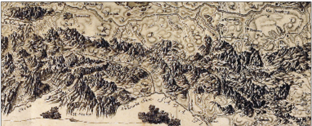
Figure 12: Slovenian Alps in the work of Baltazar Hacquet Oryctography of Carniola (Volume III, 1784).

In the second half of the 18th century (1784–1787), Slovenian Alps were also depicted on the Joseph II Military Land Survey maps (First (Habsburg) Military Survey). The maps were made in the largest scale until then (1: 28,800). Today these maps are regarded as the highest quality cartographic product of the era, which were at that time a strictly guarded secret. Relief is shown by hachures and additional clearness is achieved by the use of different colours. The maps are relatively accurate for lowlands, but very inaccurate for mountainous areas (Figure 14; Zorn 2007; Štular 2010; Gašperič and Zorn 2011).