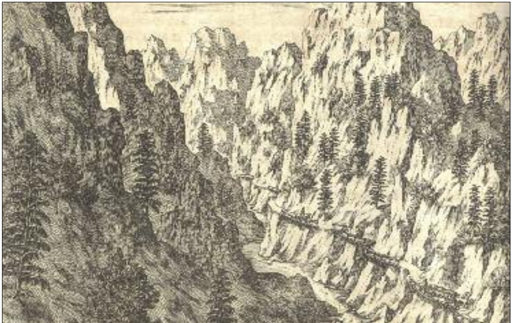
Figure 10: The Kokra valley in Kamnik-Savinja Alps on the copper engraving by Janez Vajkard Valvasor of 1689.