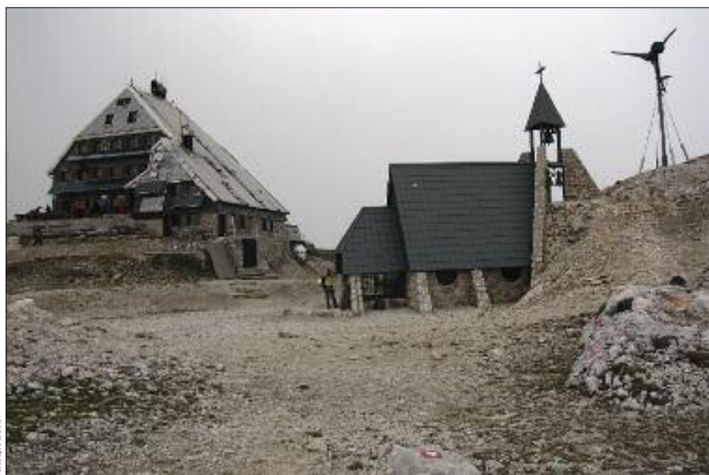
Figure 2: Chapel of Saint Mary of the Snows and Kredarica hut (2,515 m) in the Julian Alps at the beginning of the 20th century (upper figure) and today (lower figure).