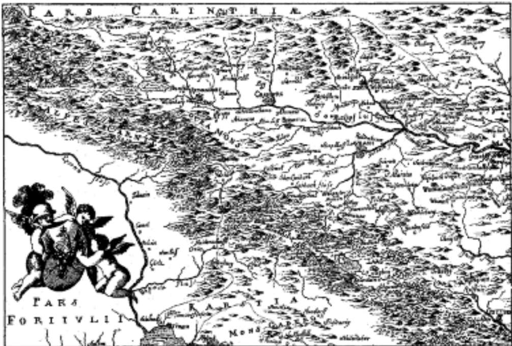
Figure 3: Map of Carniola in the work of Josias Simler De Alpibus commentarius from 1574. The Carnic Alps are placed in the Western Slovenian Prealps.